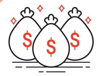
Investment in Domestic Projects and Companies

We promote innovative growth in the creative content economy